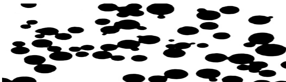
Optical Microscopy Photograph showing the morphology of lipospheres mmMorphology of Lipospheres