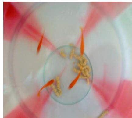
Fig. 2: Fishes Intaking Artificial Feed